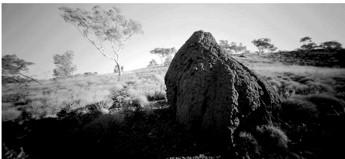
Weano Recreation Area, Karijini National Park