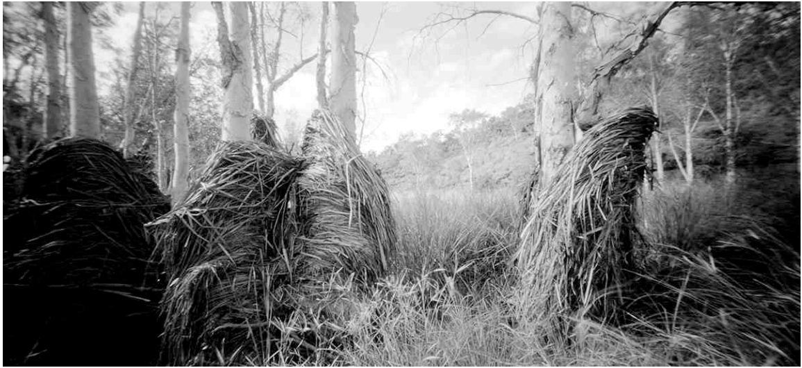
Kalamina Gorge, Karjini National Park I