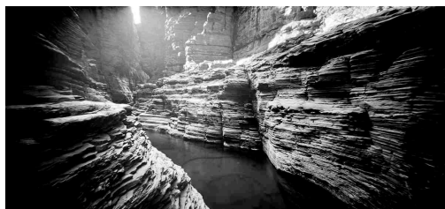
Knox Gorge, Kar ij i n i National Park I