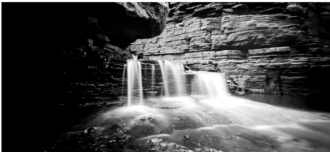
Hancock Gorge, Karijini National Park