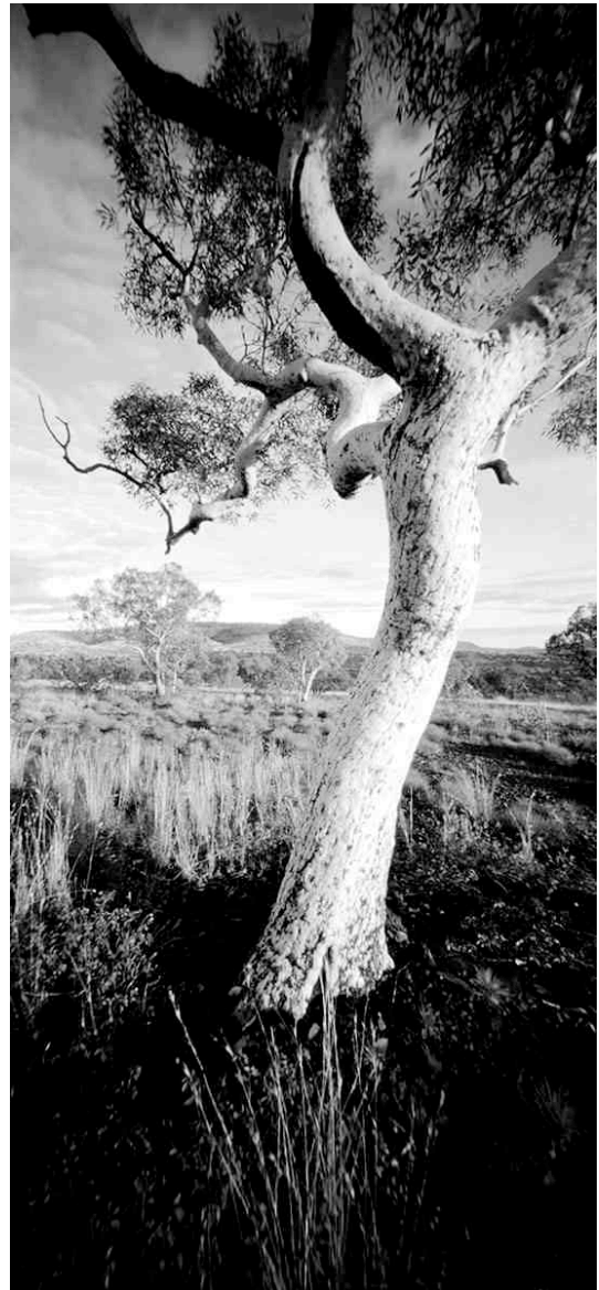
Environs, Karjini National Park