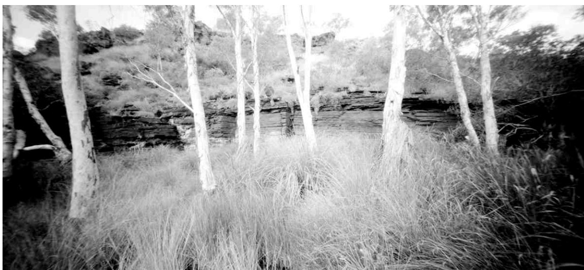
Kalamina Gorge, Karijini National Park IV