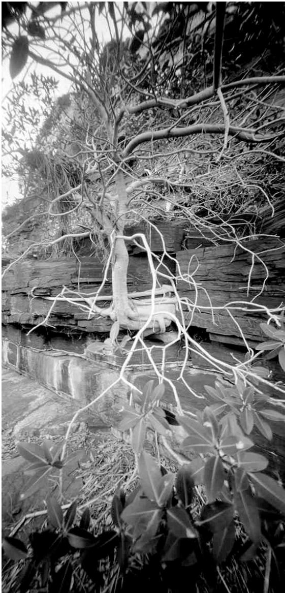
Dales Gorge, Karjini National Park II